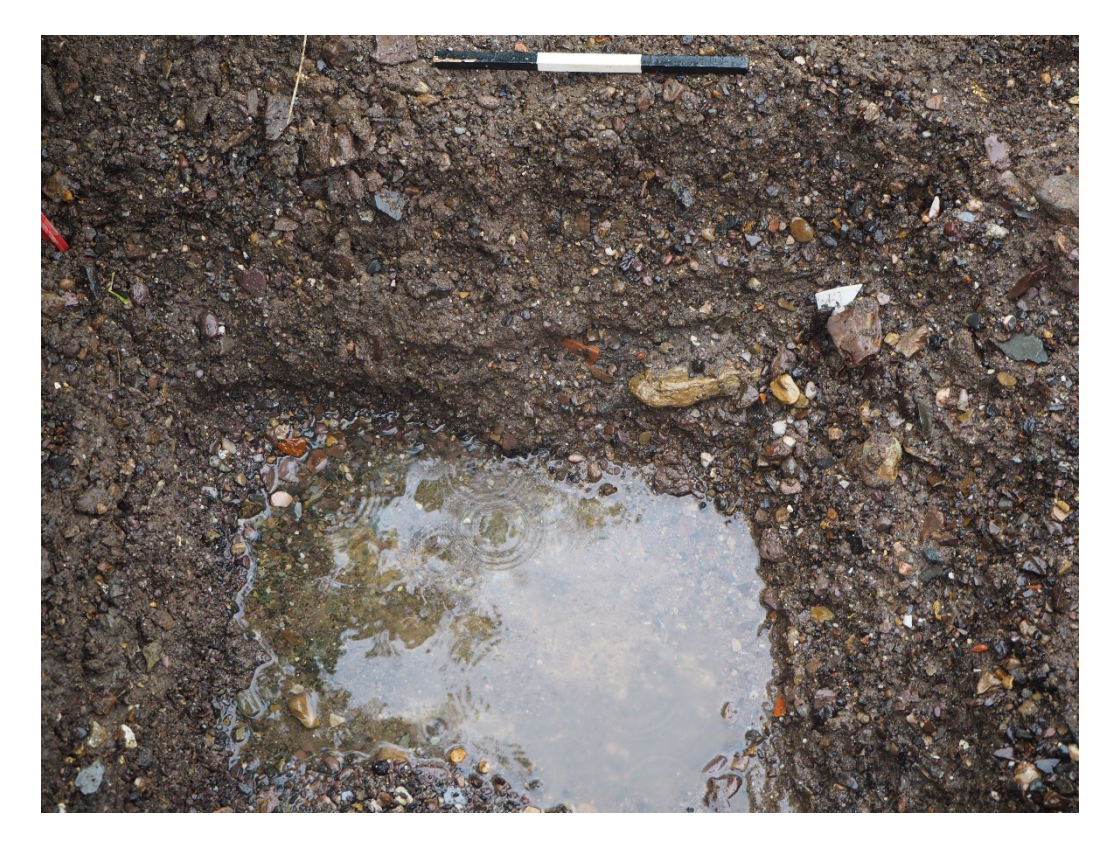
Figure 4 – This photo was taken approximately 30 seconds after the one above (Fig 3) and illustrates the rate that water was ingressing into the trench.