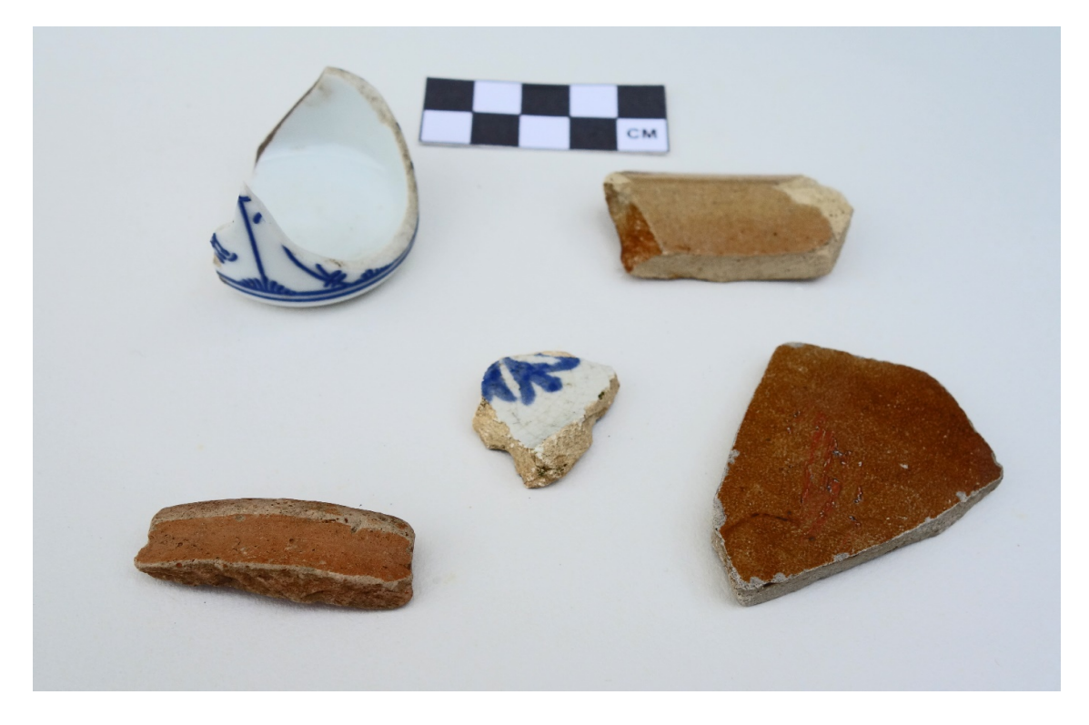
Figure 5 - A selection of pottery recovered during the excavation.