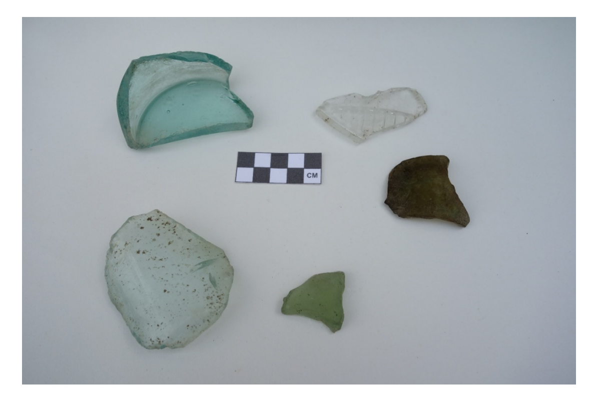
Figure 6 - Selection of broken glass recovered during the excavation. The broken bottle base (top left) is embossed 'SWC Co') and the broken car headlight lens (top right) is embossed 'Right hand drive'.