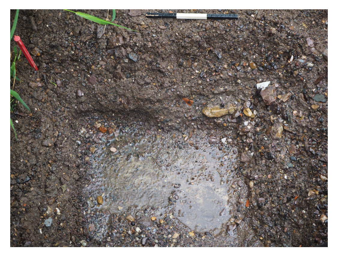
Figure 3 – Showing the floor of the leat. Scale = 30cm