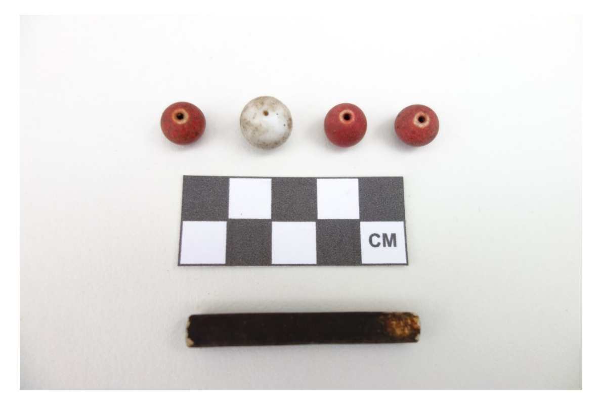
Figure 7 – Ceramic beads recovered during the excavation.